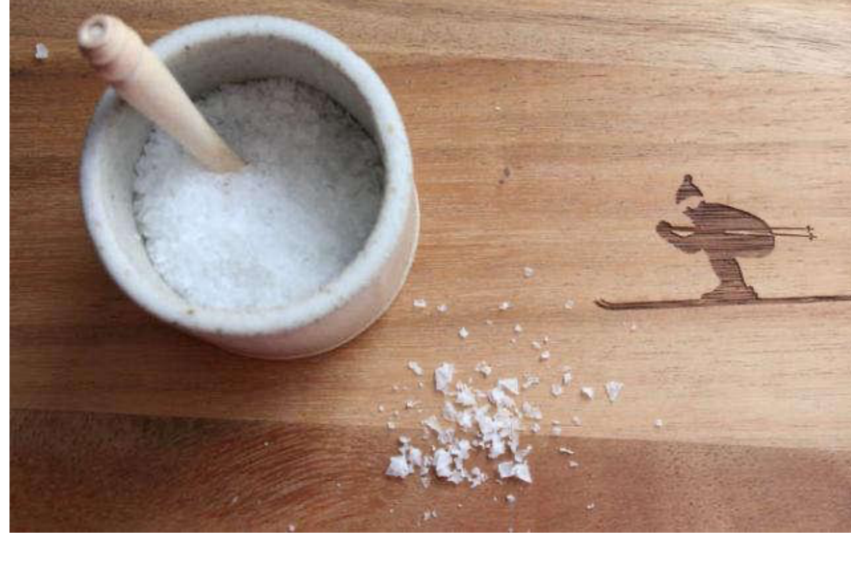
Above: Butcher calls his Salt Cellar “the ultimate in simplicity”; £8.50. To see the whole collection, visit Tom Butcher Ceramics .