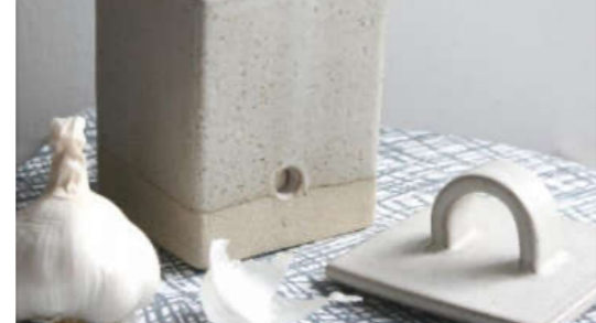
Tom Butcher Ceramics Garlic Pot £17.00 GBP from Tom Butcher Ceramics