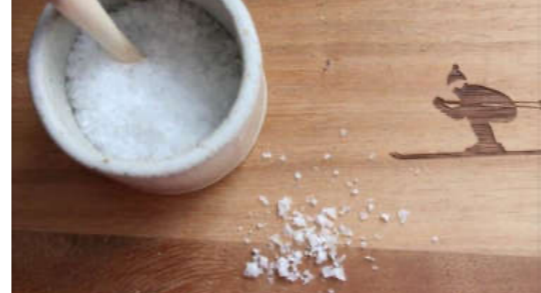
Tom Butcher Ceramics Salt Cellar £8.50 GBP from Tom Butcher Ceramics