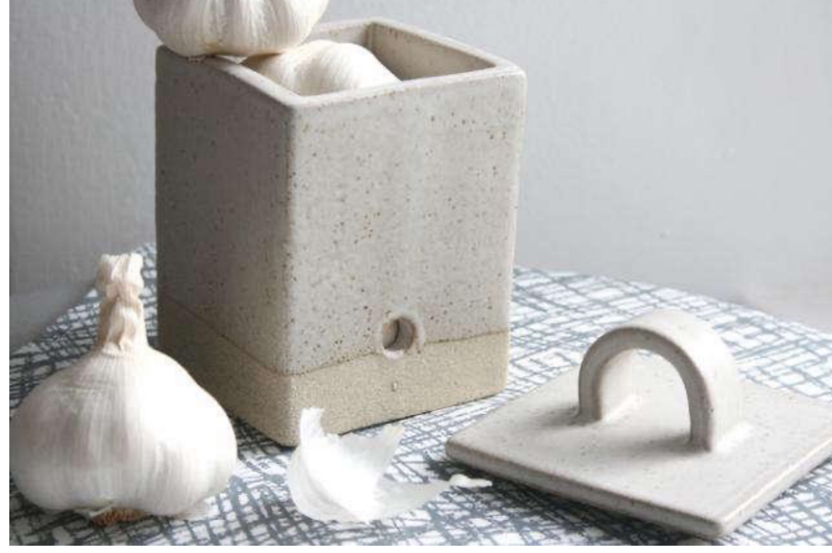
Above: The Garlic Pot is modeled in the shape of a Japanese lantern, with two holes for air circulation to keep the bulbs fresh. It’s big enough to fit three heads of garlic; £17.