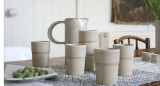
Tom Butcher Ceramics Stoneware Wine Cup £9.00 GBP from Tom Butcher Ceramics

Previous Post Aviation Luggage in Kildare Town, Ireland March 13, 2012