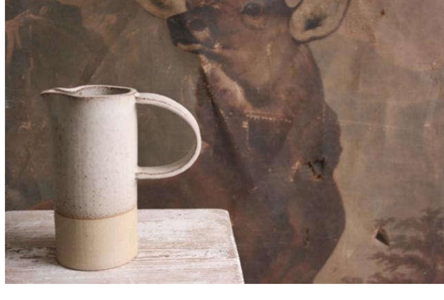
Above: The Carafe is equally well-suited for orange juice, a sprig of lilac, or red wine; £24.