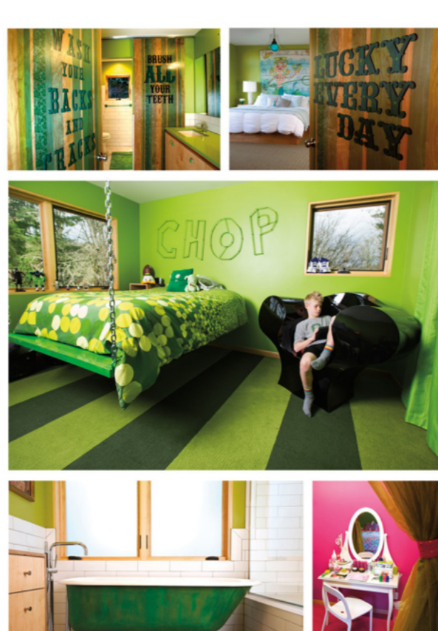
In the bedrooms and bathrooms, words pepper the walls: a tongue-in-cheek welcome to the master suite, the nickname "Chop", and parental admonishments in the kids' bathroom.

The family shared a tiny guesthouse (formerly a detached garage a short walk uphill) during the remodels, all five family members rotating through one bathroom.