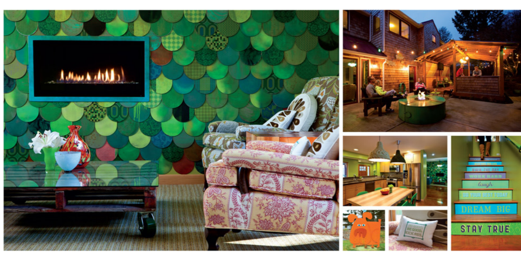
Color, pattern, and texture run wild in the Gallaghers' house, from the wall of printed metal scales that Tim hung in the living room to the back patio illuminated by a steel fire pit, the knitted lampshades in the dining areas, and the inspirational adages throughout.

The thread that pulls all these details together is a unique aesthetic—part retro-mod, part funky-eclectic, part underwater theme, all unabashedly playful. Gretchen and Tim Gallagher grew up together in Southern Oregon, and both studied art in college.